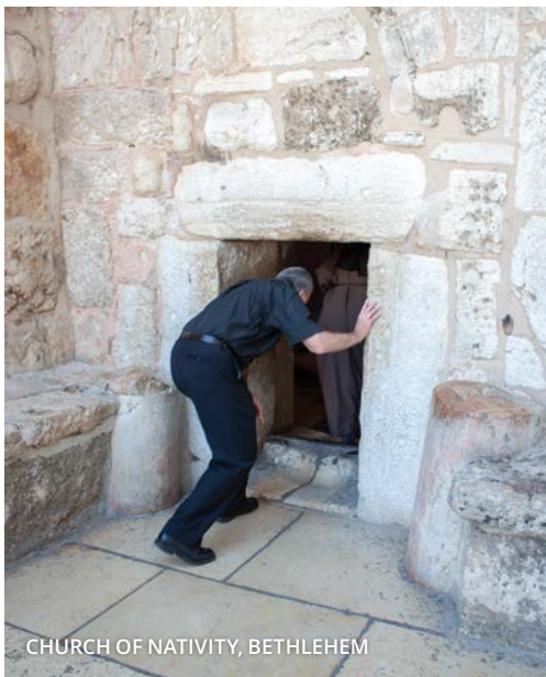
CHURCH OF NATIVITY, BETHLEHEM