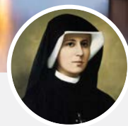
Saint Faustyna Kowalska of the Blessed Sacrament