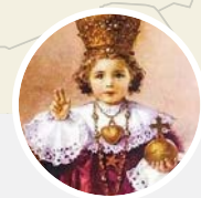
Infant Jesus of Prague Prague, Czech Republic