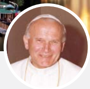
Saint John Paul II Karol Józef Wojtyła