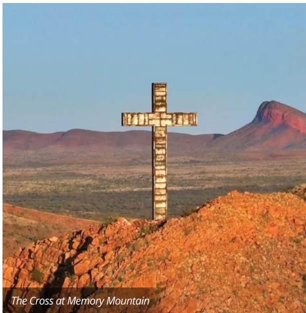
The Cross at Memory Mountain