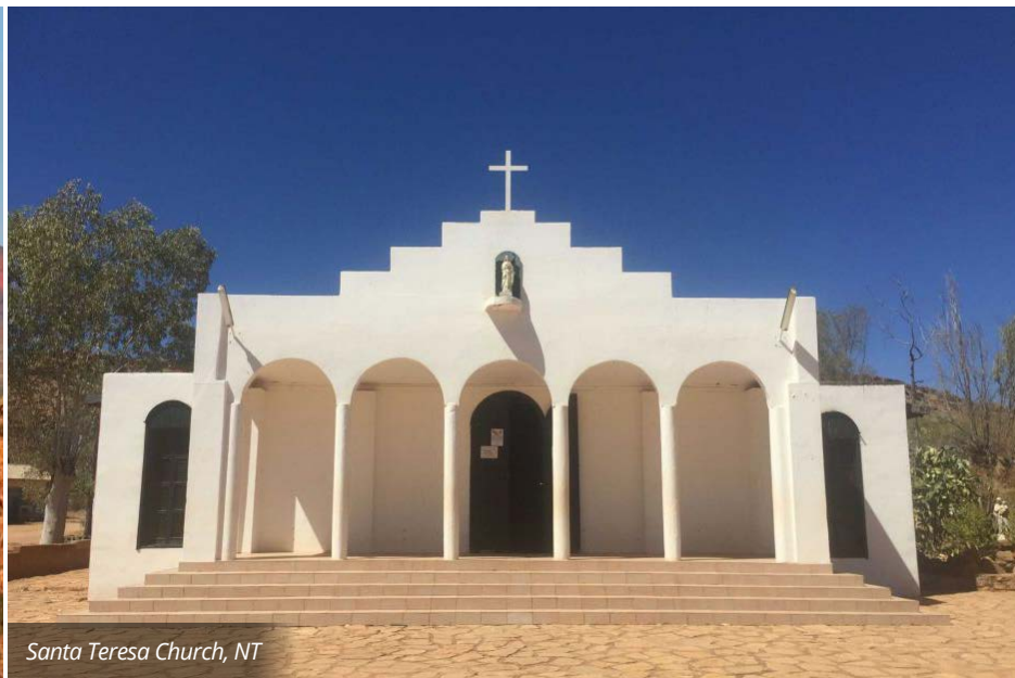
Santa Teresa Church, NT