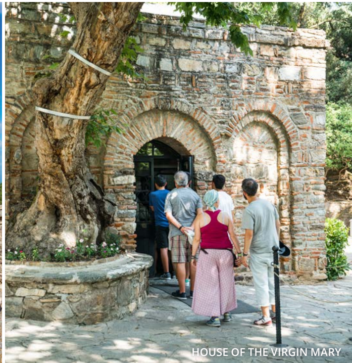
HOUSE OF THE VIRGIN MARY

Optional 3-Night Istanbul & Gallipoli Pre-tour. Athens (2) • Epidaurus • Corinth (1) • Hosios Loukas • Meteora (2) • Berea • Kavala (1) • Philippi • Thessaloniki (1) • Aegean Cruise (4): Mykonos, Ephesus, Patmos, Rhodes, Crete, Santorini. Option 3-Night St Paul in Malta Post-tour.