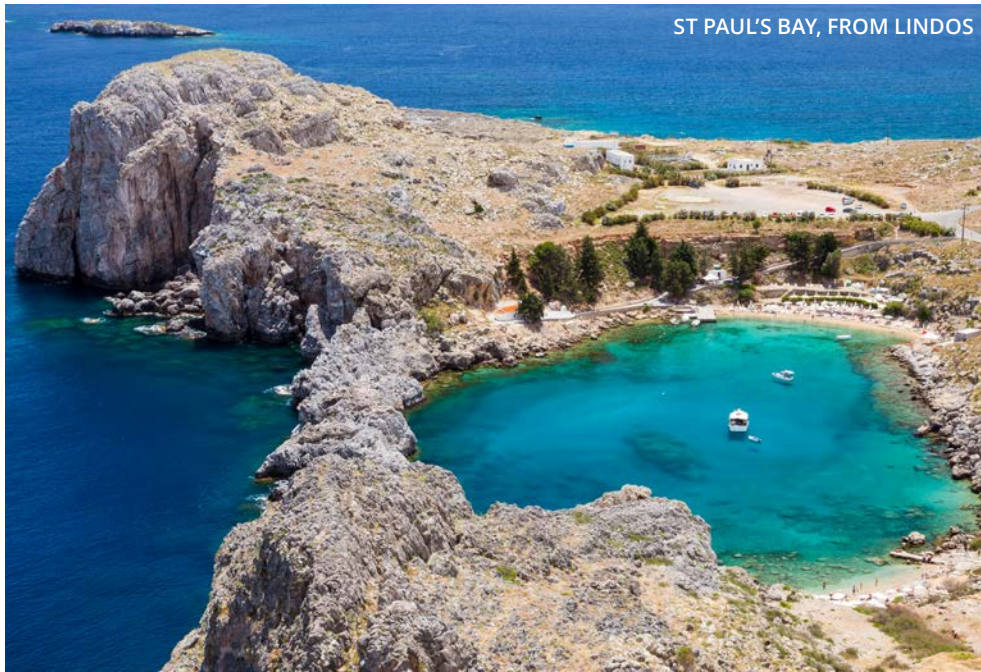
ST PAUL'S BAY, FROM LINDOS